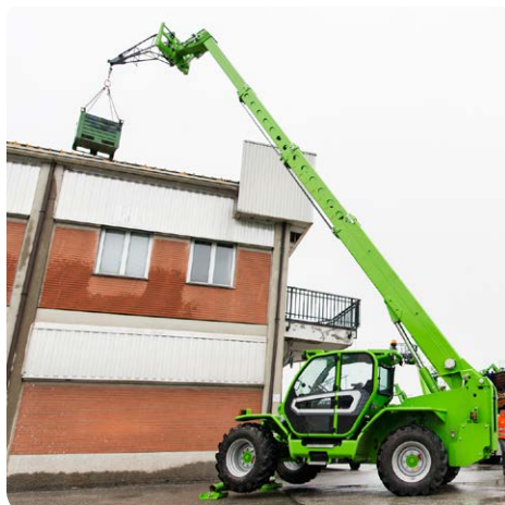
Panoramic series with a max. lift height of 12 to 18 m with a lifting capacity of up to 5 t

The Merlo Group has been a market leader in telehandlers and lifting equipment since 1964.