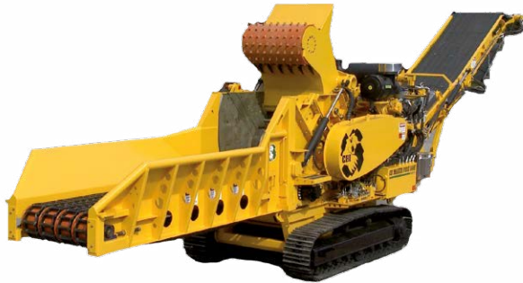
Wood chipper 5400 BT weight from 31,700 to 34,400 kg

A leading manufacturer of equipment for the wood and biomass industries.