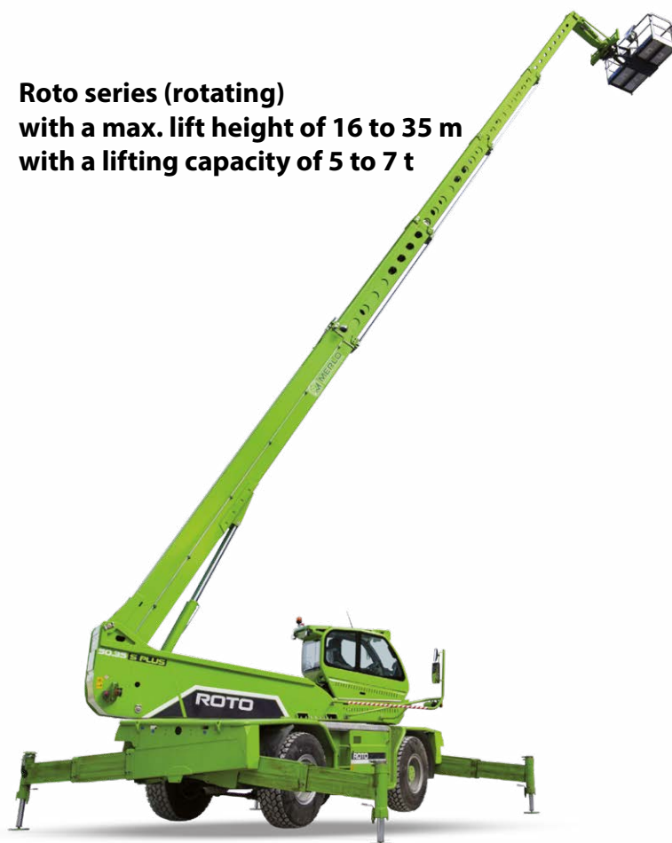
Roto series (rotating) with a max. lift height of 16 to 35 m with a lifting capacity of 5 to 7 t