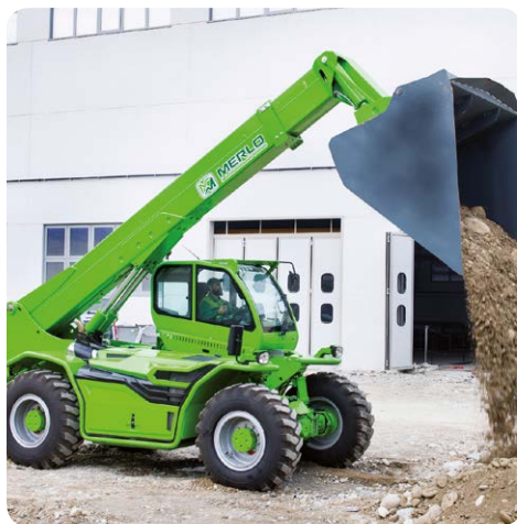
Heavy Duty series with a max. lift height of 8 to 10 m with a lifting capacity of 5 to 12 t